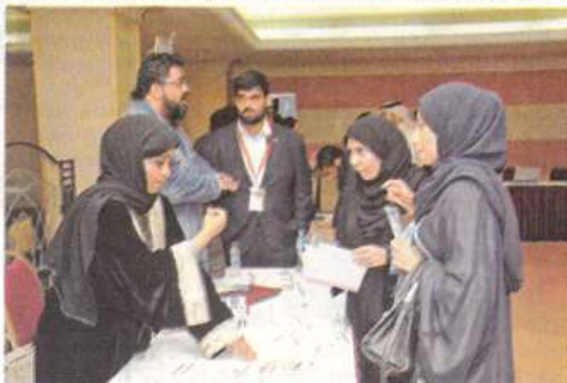
Youths at the coaching initiative

The initiative provided participants with expert advice on professional curriculum vitae writing