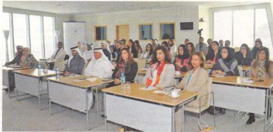
The participants of the workshop